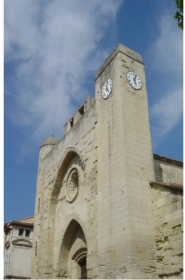
the Ramparts of Aigues Mortes