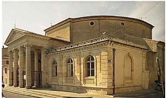
The Big Temple in Vauvert