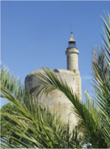
The Warden Tower